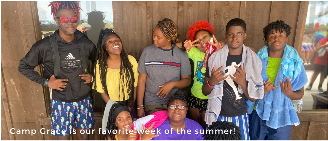
Camp Grace is our favorite week of the summer!

"It's hard not to feel the presence of God in Bel-Aire. Seeing and hearing the Boost students take time to remember the Lord's Prayer and learning how to pray both will always be one of the best ways I've experienced God working this year. Being around the teens and watching them become more receptive to God's word each week and actually trying to apply it to their everyday lives. God is continuously providing us with the ability to make Bel-Aire possible.