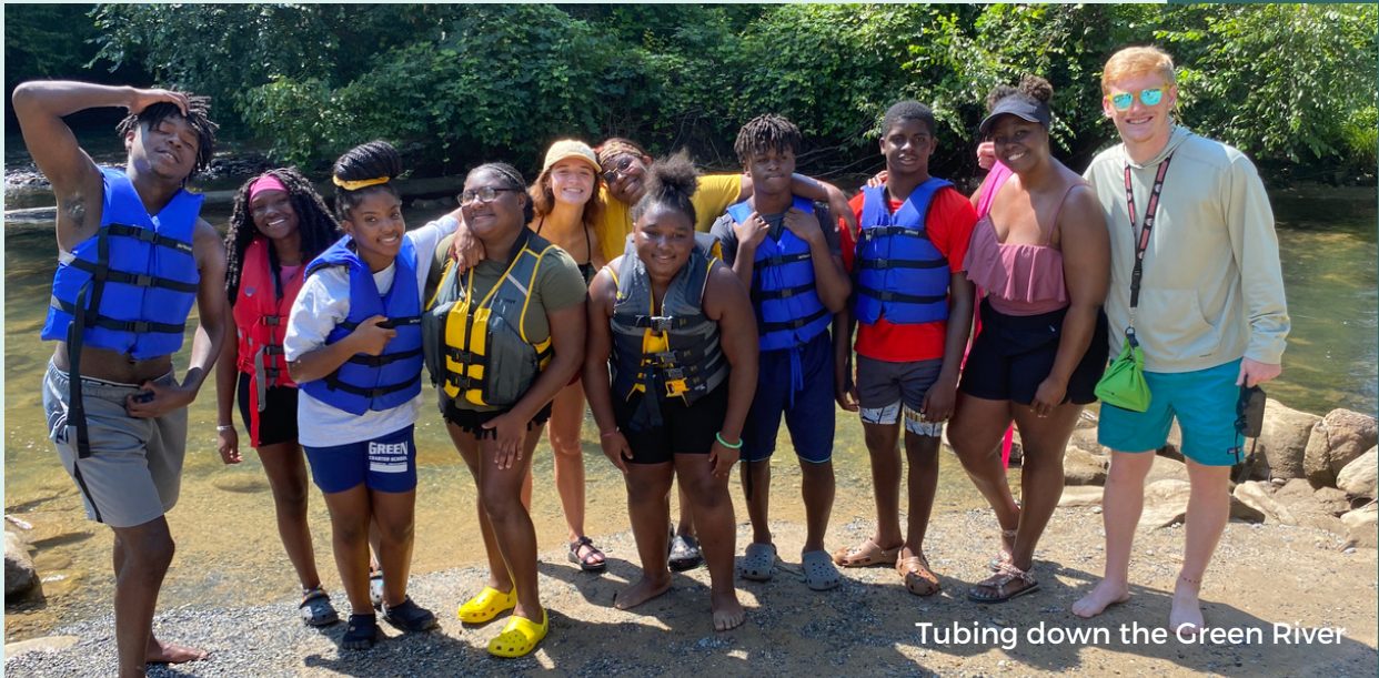
Tubing down the Green River