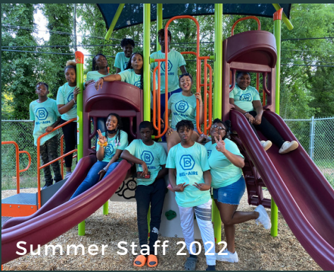
Summer Staff 2022

STUDENTS RECEIVED ACADEMIC SUPPORT OR TUTORING