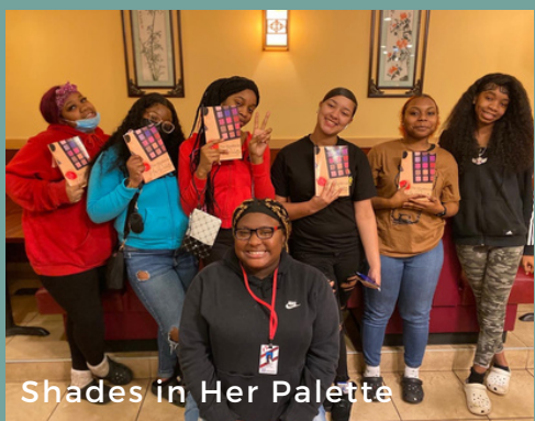
Shades in Her Palette

BASKETBALL GAMES ON THE COURT (ITS HARD TO COUNT THE BASKETBALL NUMBER)