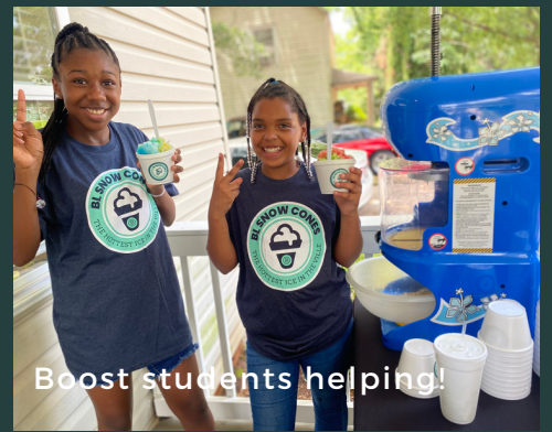
Boost students helping!