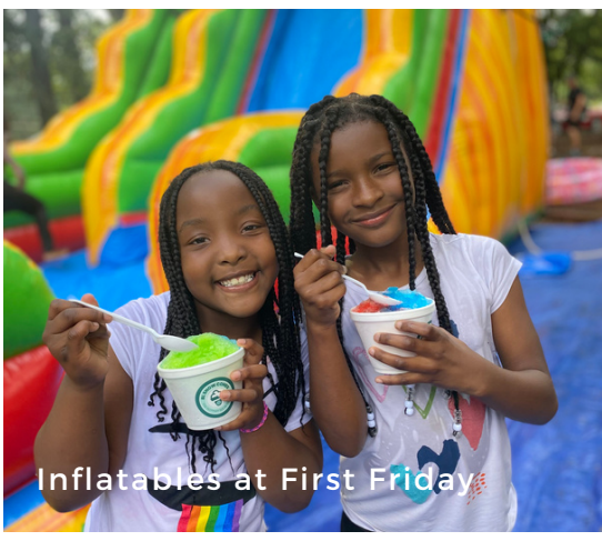
Inflatables at First Friday

"It's hard not to feel the presence of God in Bel-Aire. Seeing and hearing the Boost students take time to remember the Lord's Prayer and learning how to pray both will always be one of the best ways I've experienced God working this year. Being around the teens and watching them become more receptive to God's word each week and actually trying to apply it to their everyday lives. God is continuously providing us with the ability to make Bel-Aire possible.