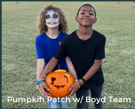
Pumpkin Patch w/ Boyd Team