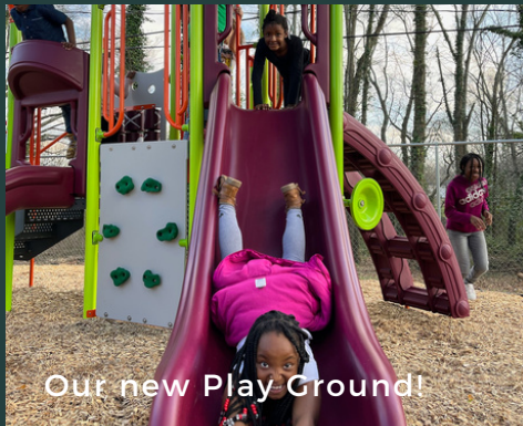
Our new Play Ground!