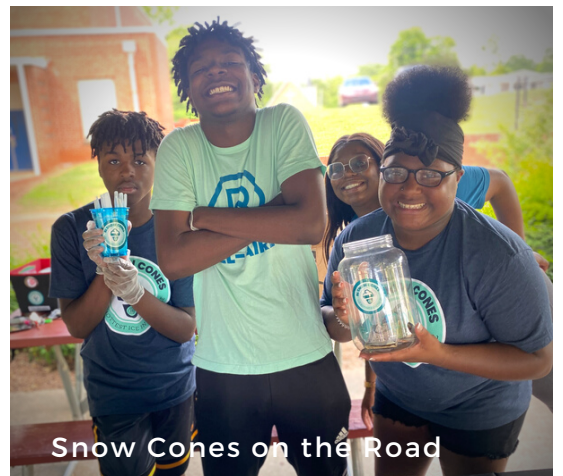
Snow Cones on the Road