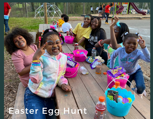
Easter Egg Hunt