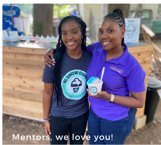
Mentors, we love you!