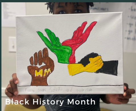
Black History Month