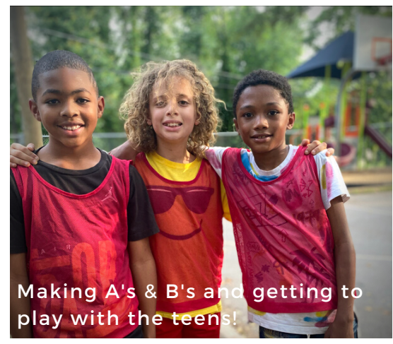
Making A's & B's and getting to play with the teens!

My favorite part of my job is definitely the relationships I have built with the students. I love having the BOOST girls notice changes about my hair or the BOOST boys coming up and telling me some of the craziest stories I have ever heard. I enjoy connecting with the RISE ladies and having them trust me enough to look at me as not only a friend but an older sister. This year, I had a student write a message on a card and say, " I love you because It has been long years and you have never gave up on us." Hearing things like this is reassurance that I am exactly where God wants me to be.