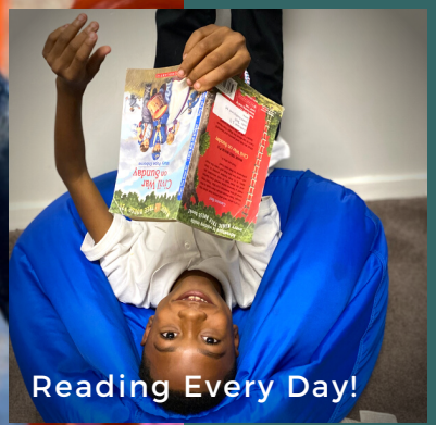
Reading Every Day!