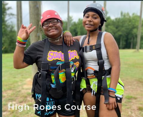
High Ropes Course