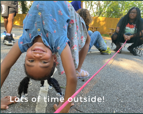
Lots of time outside!

EACH OF THESE NUMBERS REPRESENTS A STORY, AND WE ARE SO THANKFUL FOR EACH OF YOU WHO MADE THIS YEAR AND THESE STORIES POSSIBLE!