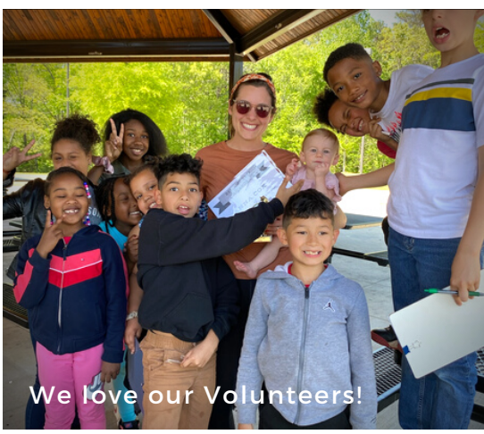
We love our Volunteers!

My favorite part of my job is definitely the relationships I have built with the students. I love having the BOOST girls notice changes about my hair or the BOOST boys coming up and telling me some of the craziest stories I have ever heard. I enjoy connecting with the RISE ladies and having them trust me enough to look at me as not only a friend but an older sister. This year, I had a student write a message on a card and say, " I love you because It has been long years and you have never gave up on us." Hearing things like this is reassurance that I am exactly where God wants me to be.